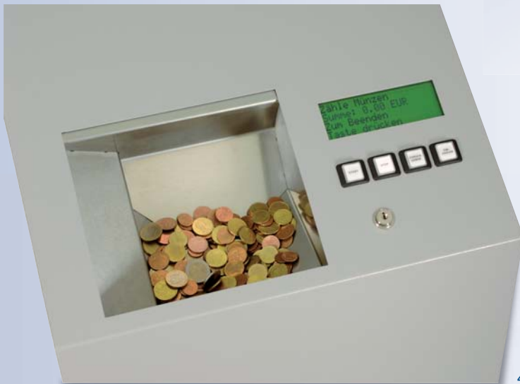
4-line LCD with 4-key operation

The innovative coin module from NOVOTECH fulfills customers' requirement for maximum performance, counting accuracy and reliability. Especially in the problematic field of the coin deposit where a high reliability is indispensable a technological high-end solution is required. NOVOTECH's patented* technology of the vertical coin conveying warrants reliability for real 24h self-service operation. In comparison to the traditional coin counting technology the vertical conveying bases on a non-chaotic vertical coin conveying against gravity, therefore, an extreme high robustness against foreign bodies can be promised.